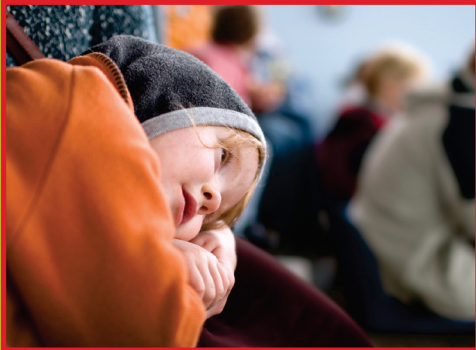
Photo: © iStockphoto.com / Frank DeMeyer / for illustrative purposes only