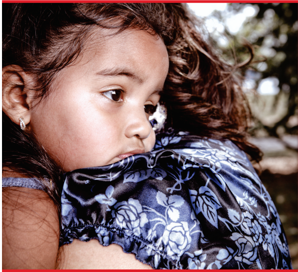
Photo: ©iStockphoto.com / ProArtWork / for illustrative purposes only

W hen alarms are ringing, the electricity goes out, or the unexpected occurs, it is your emotions and relationships that can create a sense of calm and assurance.