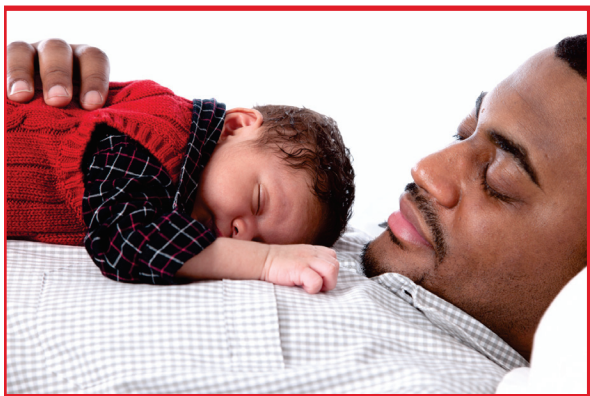
for illustrative purposes only

L ong after the winds and rains stop and the sun begins to shine, children—and adults—can and often do continue to experience repercussions from the event.